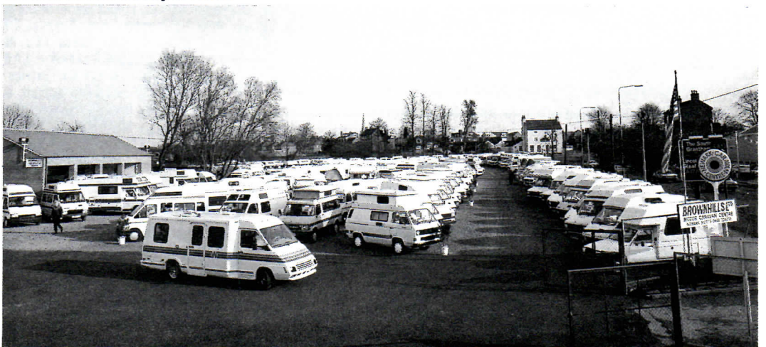
The Brownhills line up with the Le Sharo in the vanguard.