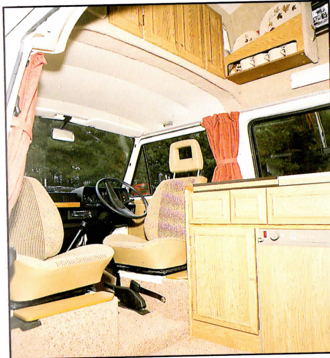
KOMET double bed