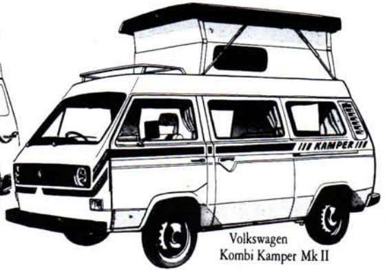
Volkswagen Kombi Kamper Mk II