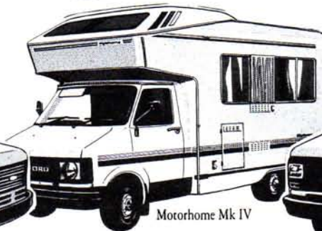
Motorhome Mk IV