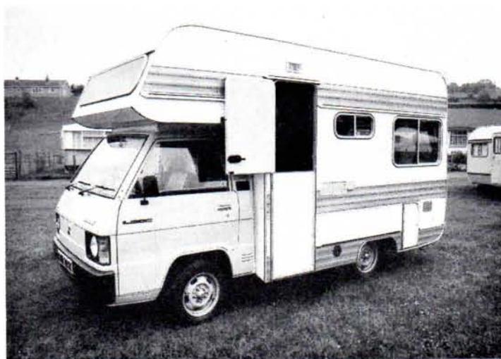
Colt Pioneer — 'a very serious rival to the smaller Volkswagens'.