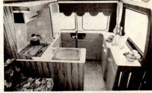
The Renault Romance from Richard Holdsworth. With compact dimensions (it's shorter than the VW) and with fuel consumption figures well into the thirties, it challenges the Volkswagen for the most popular motor caravan. Looking forwards in the Renault, Richard Holdsworth demonstrates his swivel cab seats and table which provide an additional 'room'. Other constructors' layouts on these vehicles finish behind the cab. On the right is shown the superb kitchen area which provides storage space and working surfaces belying the compact dimensions of the vehicle.

are complemented by orange Formica door facings and beechwood handles.