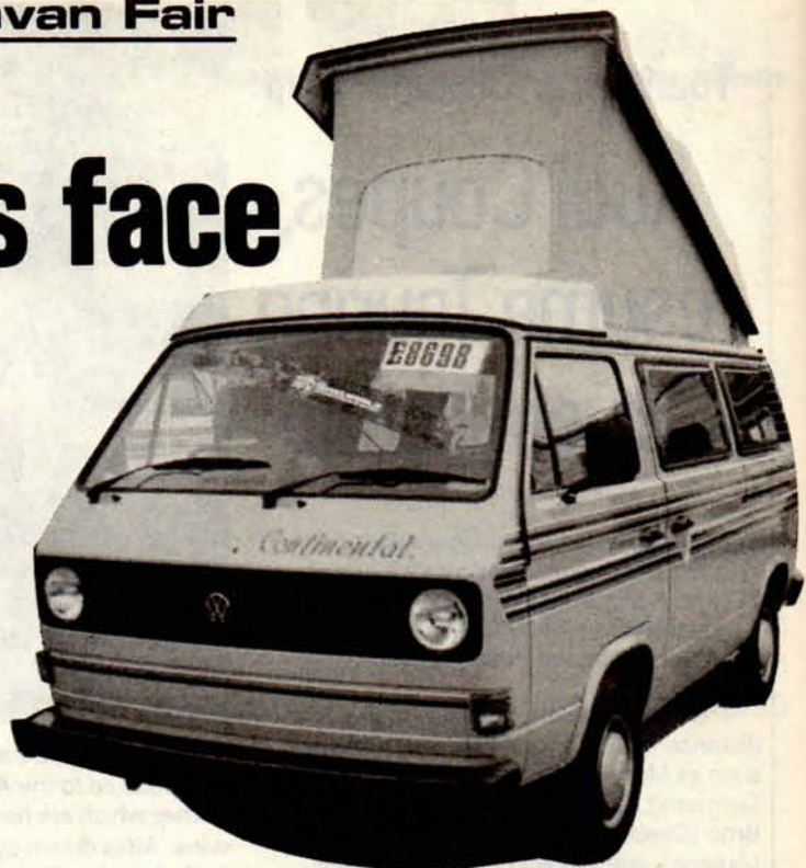
VW Westfalia Continental from Travelworld

A t the fifth National Motor Caravan Fair held at Brands Hatch Volkswagen, although no longer enjoying their predominance in the motor caravan world of ten years ago, were still the most numerous marque on the camping fields.