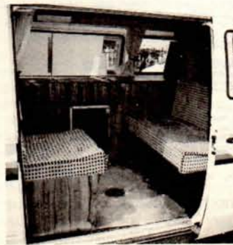
The richness of real wood veneers in a Holdsworth Villa VW.

The Westfalia conversion is still easily identified by its distinctive, front-lifting elevating roof. To accommodate the folding upper double bed, the roof moulding is stepped and the Westfalia therefore looks a little taller than its British rivals.