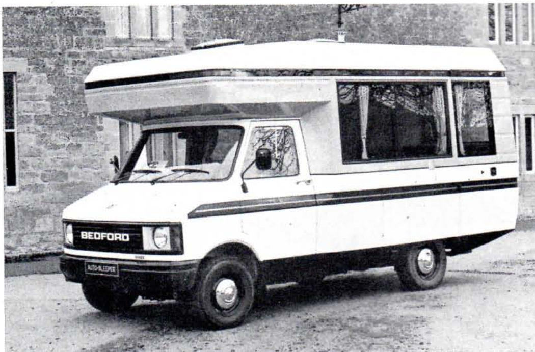
Bedford Coachbuilt Auto-Sleeper SV100.

Having recently clocked up 750 miles in a Colt Pioneer in a couple of days, I consider it to be a very serious rival to the smaller