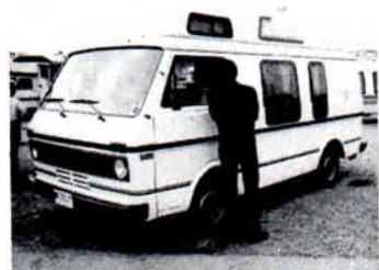
This spotless Cavalier Coachman VW LT had already covered 24,000km in its first year. Engine is VW 6-cylinder diesel.

Germany versus France versus Japan; to see how that three-sided battle is going, don't miss next year's Motor Caravan Fair . . . !